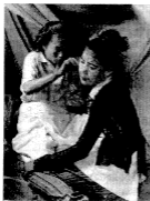
Figure 2. Applying the face make-up, circa 1960s.

The Yakan costume basically consists of the badju (top) and sawal (trousers) which are made of woven or purchased material. In the past, for the Yakans of Lamitan town proper particularly, these garments were made out of a black cloth called naynay . Traditionally, the blouses and trousers are tight at the sleeves and leggings. They may be worn by both men and women but with restrictions as to why, how, and by whom the clothes should be worn.