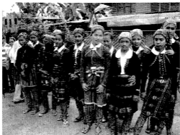
Figure 5. Parangbasak National High School students.

Asbiyan Damsali is an old weaver who used to serve the royal family. She is also skilled in embroidery. Due to her failing eyesight, she no longer weaves but now only teaches her female relatives the old techniques. She relates that when she was younger and still able-bodied, she made a set of costumes for Sultan Unding's (son of Datu Kalun) family which she personally warped and designed. She felt fulfilled and proud seeing the members of the family wearing the costume she made.