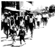
Figure 1. Yakans participating in the Lami-lamihan Festival, 1983.